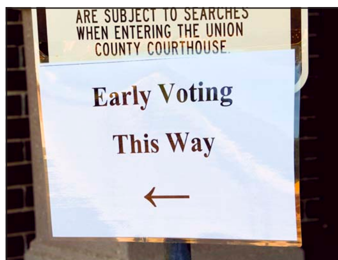
Signs like these can be found on the lower level of the Union County Courthouse, pointing the way to the advanced in-person voting area in the Jury Assembly Room.

The high number of mail-in absentee ballots being