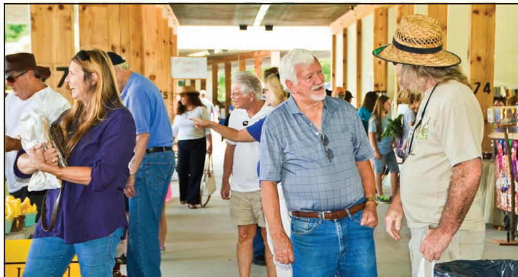
It may be some time yet before the Farmers Market returns to the bustling social environment of yesteryears, as depicted in this photo taken on a warm market day in 2016.